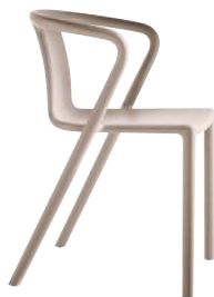
Matt colour Beige 1450 C