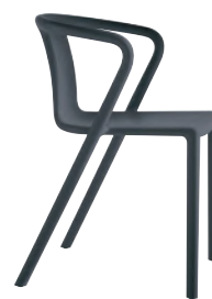
Matt colour Grey Anthracite 1418 C