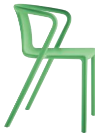
Matt colour Green 1320 C