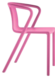
Matt colour Fuchsia 1150 C