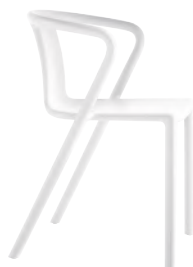
Matt colour Pure White 1690 C