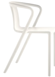
Matt colour White 1730 C