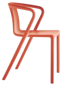
Matt colour Orange 1086 C