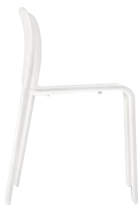
Matt colour White 1735 C