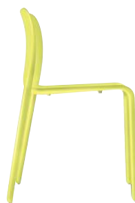
Matt colour Lime Green 1344 C