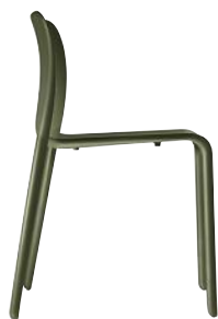
Matt colour Olive Green 1664 C