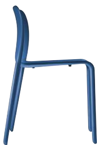
Matt colour Blue 1223 C