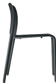
Matt colour Black 1763