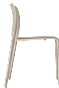
Matt colour Beige 1450 C