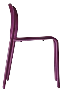
Matt colour Purple 1153 C