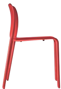
Matt colour Red 1127 C