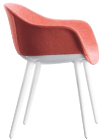
Frame: Glossy White 1736 C Seat + Back: Red F-124 (542)