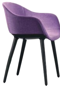
Frame: Glossy Black 1763 C Seat + Back: Purple F-482 (562)