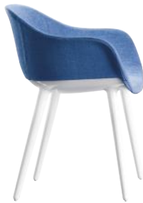
Frame: Glossy White 1736 C Seat + Back: Light Blue F-223 (752)