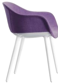
Frame: Glossy White 1736 C Seat + Back: Purple F-482 (562)