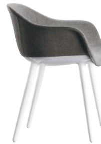
Frame: Glossy White 1736 C Seat + Back: Grey F-508 (182)