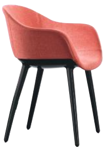
Frame: Glossy Black 1763 C Seat + Back: Red F-124 (542)