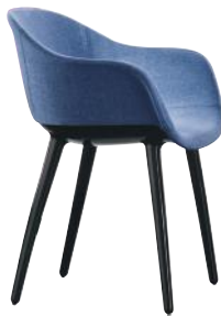
Frame: Glossy Black 1763 C Seat + Back: Light Blue F-223 (752)