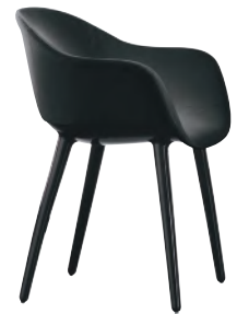
Frame: Glossy Black 1763 C Seat + Back: Black L-0795 leather