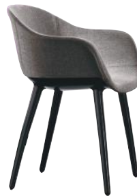
Frame: Glossy Black 1763 C Seat + Back: Grey F-508 (182)