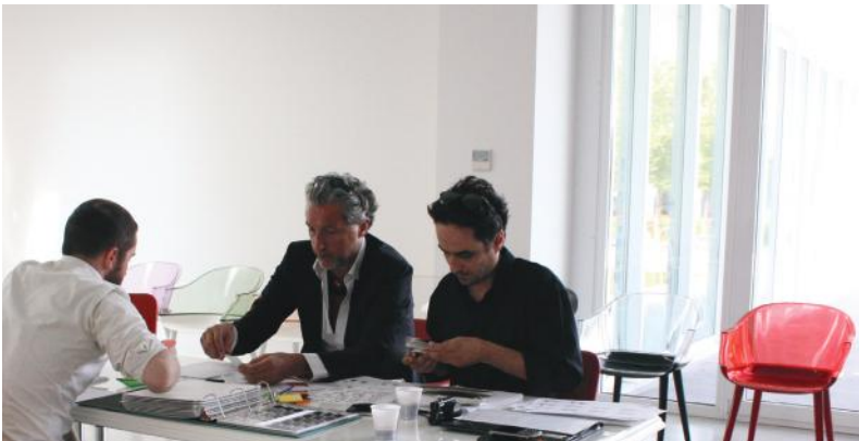
Designer in Magis

of Cyborg, a seat with a highly resistant and versatile polycarbonate shell. The seat can then be completed with backrests in a selection of different natural or synthetic materials: from polycarbonate to wicker, from solid wood to plywood, to the most recent upholstered versions with fabric or leather cover. This further evolution of the chair is in equal parts poetic and technological, cosy and surprising, in keeping with the widest range of different settings.