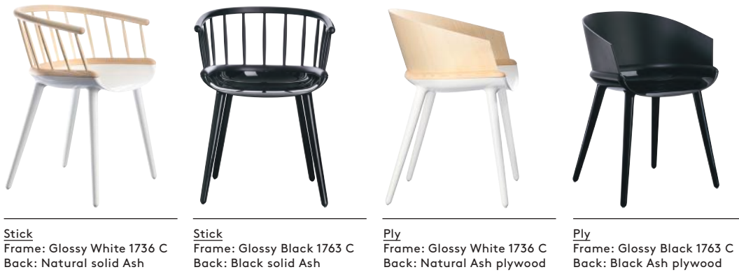
Stick Frame: Glossy White 1736 C Back: Natural solid Ash