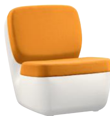
Shell: White 1736 C Cushions: Yellow F-576 (426)