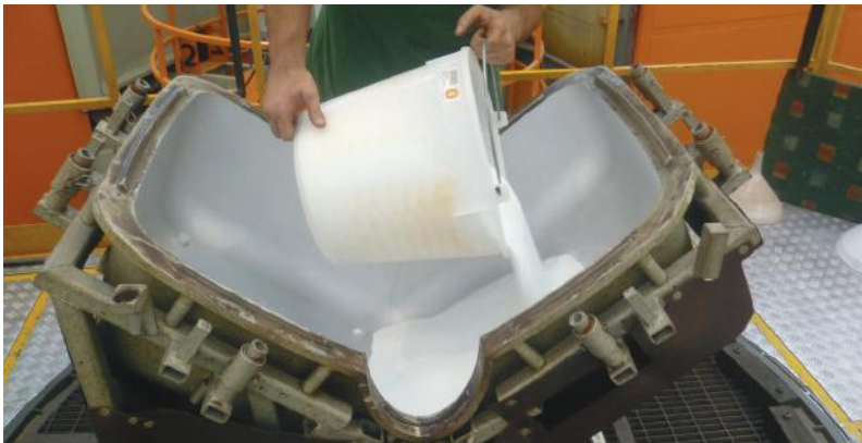
Production process and designer in Magis

The development of Nimrod low chair was the fruit of many years of research that eventually led to the definitive product, which has been on the market since 2009. Magis' initial objective was to produce this piece using blow-moulding technology, but after countless attempts to achieve the level of technical quality the company has always demanded, this quest was abandoned in favour of rotational moulding, which provided a better aesthetic definition of the chair.