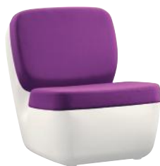
Shell: White 1736 C Cushions: Purple F-488 (666)