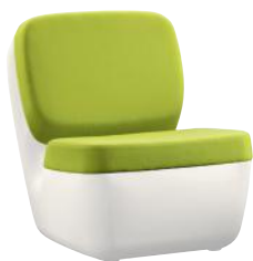
Shell: White 1736 C Cushions: Green F-346 (936)