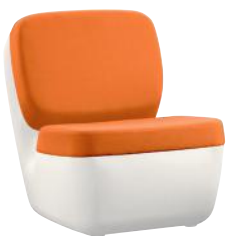
Shell: White 1736 C Cushions: Orange F-083 (542)