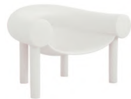
Matt colour White 1735 C