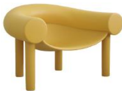
Matt colour Curry 1014 C