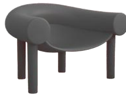
Matt colour Grey Anthracite 1429 C