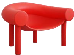
Matt colour Red 1004 C