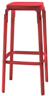
Seat + Foot-rest: Red 5083 Legs: Beech painted Red