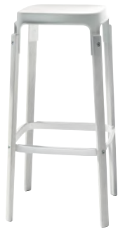
Seat + Foot-rest: White 5108 Legs: Beech painted White