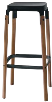
Seat + Foot-rest: Black 5140 Legs: American Walnut