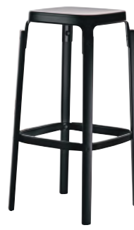
Seat + Foot-rest: Black 5140 Legs: Beech painted Black