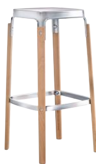
Seat + Foot-rest: Galvanized Legs: Natural Beech