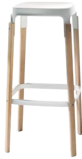
Seat + Foot-rest: White 5108 Legs: Natural Beech