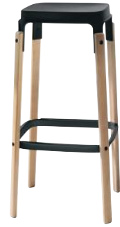
Seat + Foot-rest: Black 5140 Legs: Natural Beech