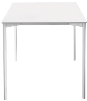
Frame: White 5108 Top: White 8500