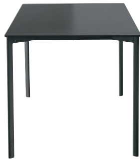
Frame: Black 5130 Top: Black 8510