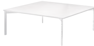
Frame: White 5108 Top: White 8500