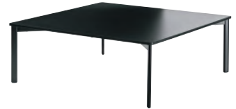
Frame: Black 5130 Top: Black 8510