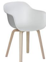
Frame: Natural Ash Seat: White 1735 C