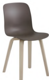
Frame: Natural Ash Seat: Beige 1452 C