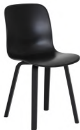
Frame: Ash painted black Seat: Black L-0060