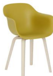
Frame: Natural Ash Seat: Mustard 1015 C