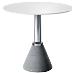
Indoor use Frame: Natural Glossy Top: White 8500