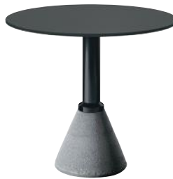
Outdoor use Frame: matt Black Top: Black 8510