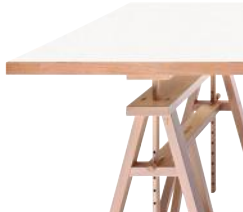
Frame: Natural Beech Top: White MDF 8500 / Black MDF 8510 (reversible)