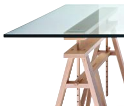
Frame: Natural Beech Top: Transparent glass