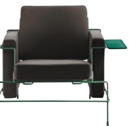
Frame: Dark Green 5021 Leather: Dark Brown L-0752 Tablet: Dark Green