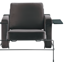
Frame: Black 5013 Fabric: Dark Brown F-521 (383) Tablet: Anthracite Grey