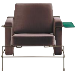
Frame: Mahogany Brown 5015 Fabric: Brown F-530 (353) Tablet: Dark Green