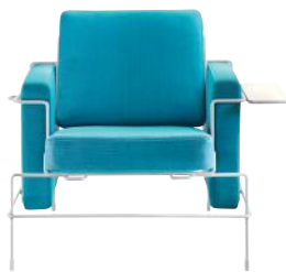
Frame: White 5011 Fabric: Turquoise F-227 Tablet: White Chaise longue and Platform not for outdoor