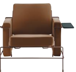
Frame: Sepia Brown 5016 Leather: Brown L-0111 Tablet: Anthracite Grey