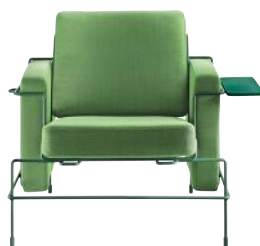
Frame: Dark Green 5021 Fabric: Green F-354 (953) Tablet: Dark Green