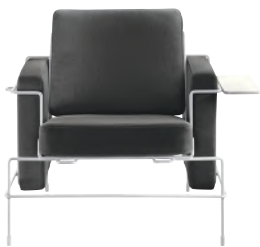
Frame: White 5011 Fabric: Black F-769 Tablet: White Chaise longue and Platform not for outdoor