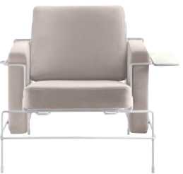
Frame: White 5011 Fabric: Beige F-266 (205) Tablet: White