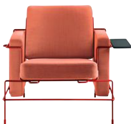
Frame: Signal Red 5019 Fabric: Orange F-088 (533) Tablet: Anthracite Grey

The Kvadrat colour numbers are indicated in brackets next to the Magis inner colour number. The information included in this product sheet are based on the last data in our current pricelist. Magis reserves the right to modify the products without notice.