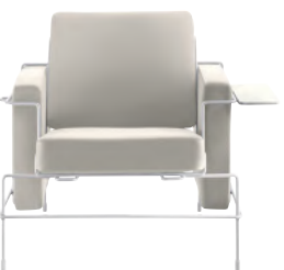
Frame: White 5011 Leather: Cream White L-0706 Tablet: White