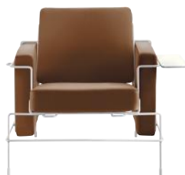
Frame: White 5011 Leather: Brown L-0111 Tablet: White