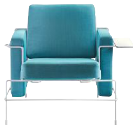
Frame: White 5011 Fabric: Light Blue F-222 (983) Tablet: White