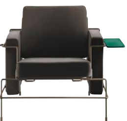
Frame: Mahogany Brown 5015 Leather: Dark Brown L-0752 Tablet: Dark Green