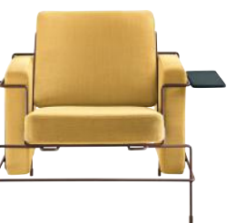
Frame: Sepia Brown 5016 Fabric: Yellow F-578 (453) Tablet: Anthracite Grey