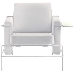
Frame: White 5011 Fabric: White F-737 Tablet: White Chaise longue and Platform not for outdoor