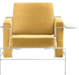
Frame: White 5011 Fabric: Yellow F-578 (453) Tablet: White