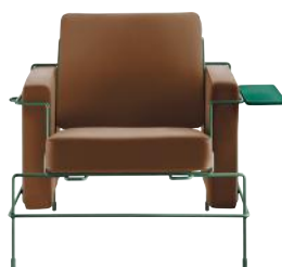
Frame: Mahogany Brown 5015 Leather: Brown L-0111 Tablet: Dark Green