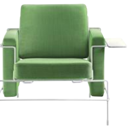
Frame: White 5011 Fabric: Green F-354 (953) Tablet: White