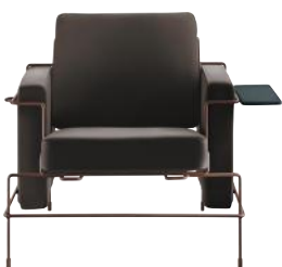
Frame: Sepia Brown 5016 Leather: Dark Brown L-0752 Tablet: Anthracite Grey