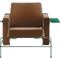
Frame: Dark Green 5021 Leather: Brown L-0111 Tablet: Dark Green