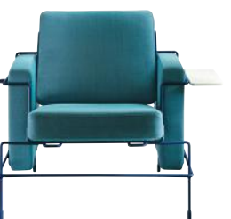
Frame: Green Blue 5017 Fabric: Light Blue F-222 (983) Tablet: White