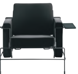
Frame: Black 5013 Leather: Anthracite Grey L-0060 Tablet: Anthracite Grey