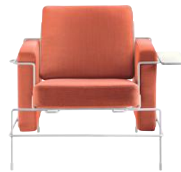
Frame: White 5011 Fabric: Orange F-088 (533) Tablet: White