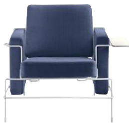
Frame: White 5011 Fabric: Blue F-257 Tablet: White Chaise longue and Platform not for outdoor