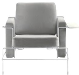
Frame: White 5011 Fabric: Light Grey F-741 (133) Tablet: White