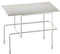
Outdoor use Frame: White 5011 Top: White Cataphoretically-treated version