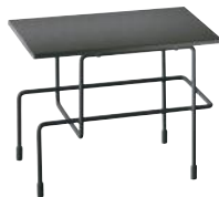
Indoor use Frame: Black 5013 Top: Anthracite Grey