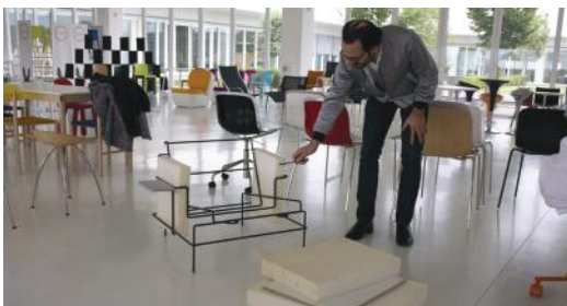
Designer in Magis

sofa, a bench in two versions, a chaise longue and an island. The collection has expanded further to include two low tables, one large, one small, and a high table, again with a metal rod frame, but with a top in artificial stone, adding another tactile sensation to the home and contract scenario.