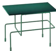
Indoor use Frame: Dark Green 5021 Top: Green