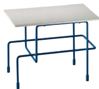
Indoor use Frame: Green Blue 5017 Top: White