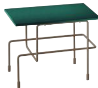
Indoor use Frame: Mahogany Brown 5015 Top: Green