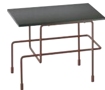
Indoor use Frame: Sepia Brown 5016 Top: Anthracite Grey