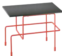
Indoor use Frame: Signal Red 5019 Top: Anthracite Grey