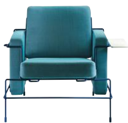
Frame: Green Blue 5017 Fabric: Light Blue F-222 (983) Tablet: White