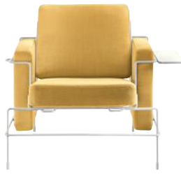
Frame: White 5011 Fabric: Yellow F-578 (453) Tablet: White