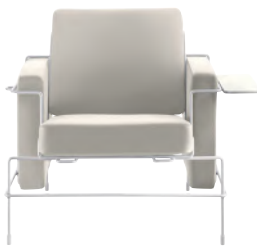
Frame: White 5011 Leather: Cream White L-0706 Tablet: White