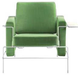
Frame: White 5011 Fabric: Green F-354 (953) Tablet: White