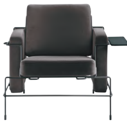
Frame: Black 5013 Fabric: Dark Brown F-521 (383) Tablet: Anthracite Grey