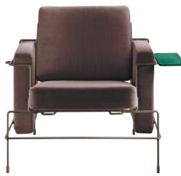
Frame: Mahogany Brown 5015 Fabric: Brown F-530 (353) Tablet: Dark Green