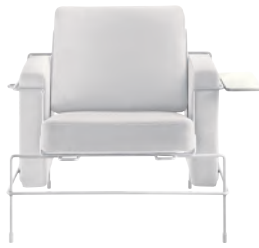
Frame: White 5011 Fabric: White F-737 Tablet: White Chaise longue and Platform not for outdoor