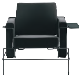
Frame: Black 5013 Leather: Anthracite Grey L-0060 Tablet: Anthracite Grey