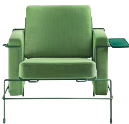
Frame: Dark Green 5021 Fabric: Green F-354 (953) Tablet: Dark Green