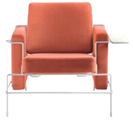
Frame: White 5011 Fabric: Orange F-088 (533) Tablet: White