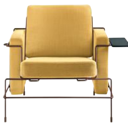
Frame: Sepia Brown 5016 Fabric: Yellow F-578 (453) Tablet: Anthracite Grey