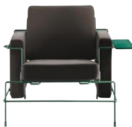
Frame: Dark Green 5021 Leather: Dark Brown L-0752 Tablet: Dark Green