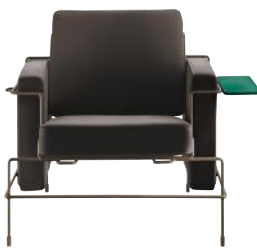
Frame: Mahogany Brown 5015 Leather: Dark Brown L-0752 Tablet: Dark Green