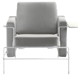
Frame: White 5011 Fabric: Light Grey F-741 (133) Tablet: White