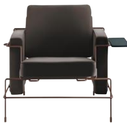
Frame: Sepia Brown 5016 Leather: Dark Brown L-0752 Tablet: Anthracite Grey