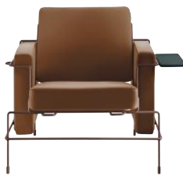
Frame: Sepia Brown 5016 Leather: Brown L-0111 Tablet: Anthracite Grey