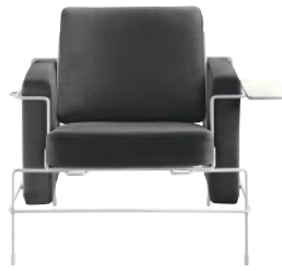
Frame: White 5011 Fabric: Black F-769 Tablet: White Chaise longue and Platform not for outdoor