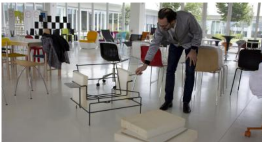
Designer in Magis

sofa, a bench in two versions, a chaise longue and an island. The collection has expanded further to include two low tables, one large, one small, and a high table, again with a metal rod frame, but with a top in artificial stone, adding another tactile sensation to the home and contract scenario.