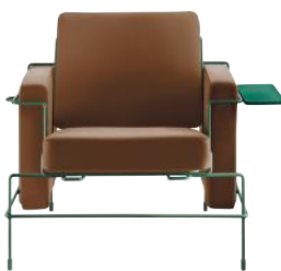
Frame: Dark Green 5021 Leather: Brown L-0111 Tablet: Dark Green