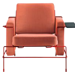
Frame: Signal Red 5019 Fabric: Orange F-088 (533) Tablet: Anthracite Grey

The Kvadrat colour numbers are indicated in brackets next to the Magis inner colour number. The information included in this product sheet are based on the last data in our current pricelist. Magis reserves the right to modify the products without notice.