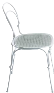
Frame: White 5110 Interlacement: Grey 1417 C + White 1673 C