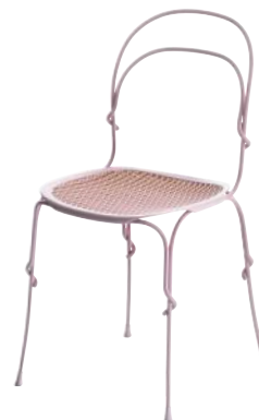
Frame: Warm Grey 5117 Interlacement: Curry 1015 C + Warm Grey 1419 C