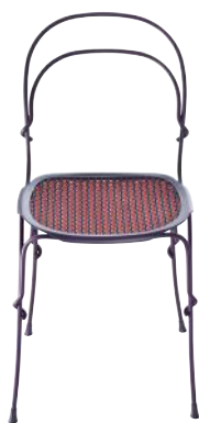
Frame: Purple Violet 5047 Interlacement: Red 1129 C + Purple Violet 1487 C