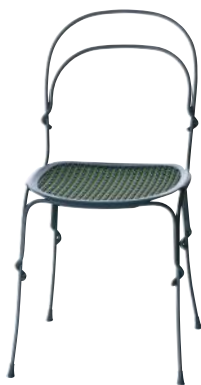
Frame: Granite Grey 5072 Interlacement: Green 1288 C + Granite Grey 1423 C