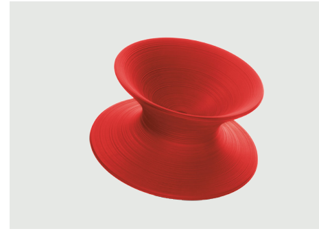
Red 1004 C