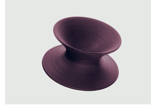
Dark Purple 1133 C