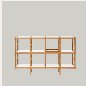
FRAME SHELF MEDIUM 2739–8401