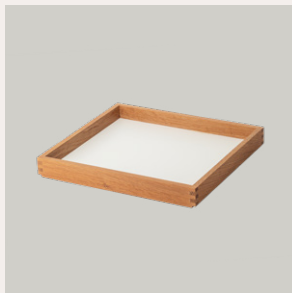
FRAME TRAY 2742–8401