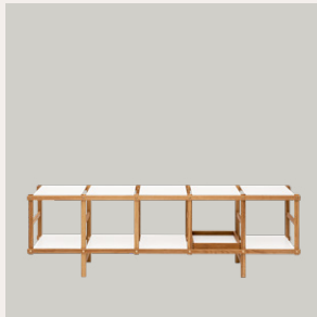
FRAME SHELF LOW 2738–8401