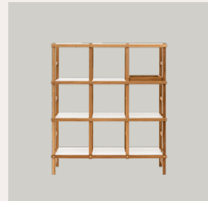
FRAME SHELF LARGE 2740–8401