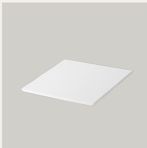
FRAME SHELF 2741–0100