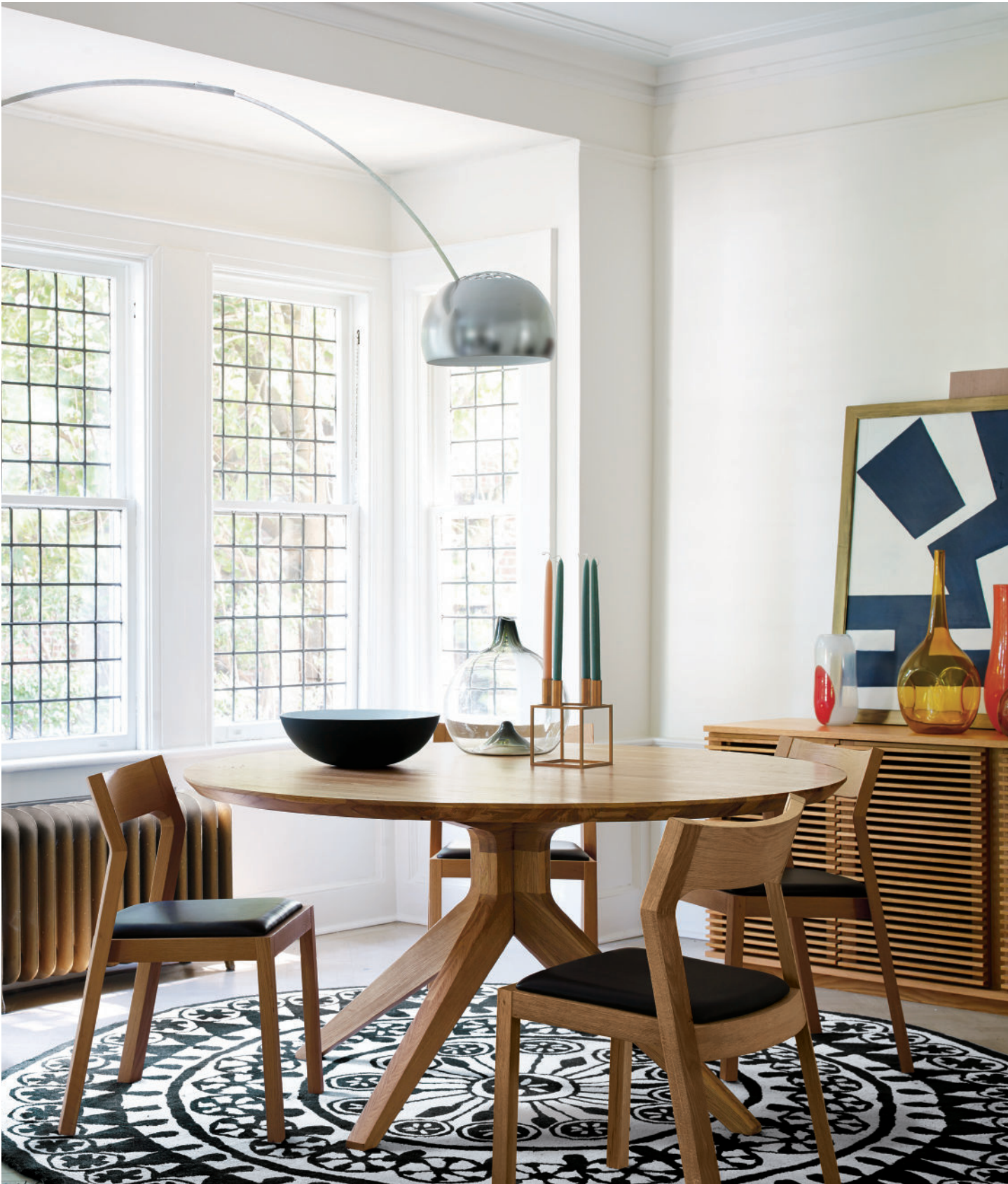
Cross Round Table by Matthew Hilton