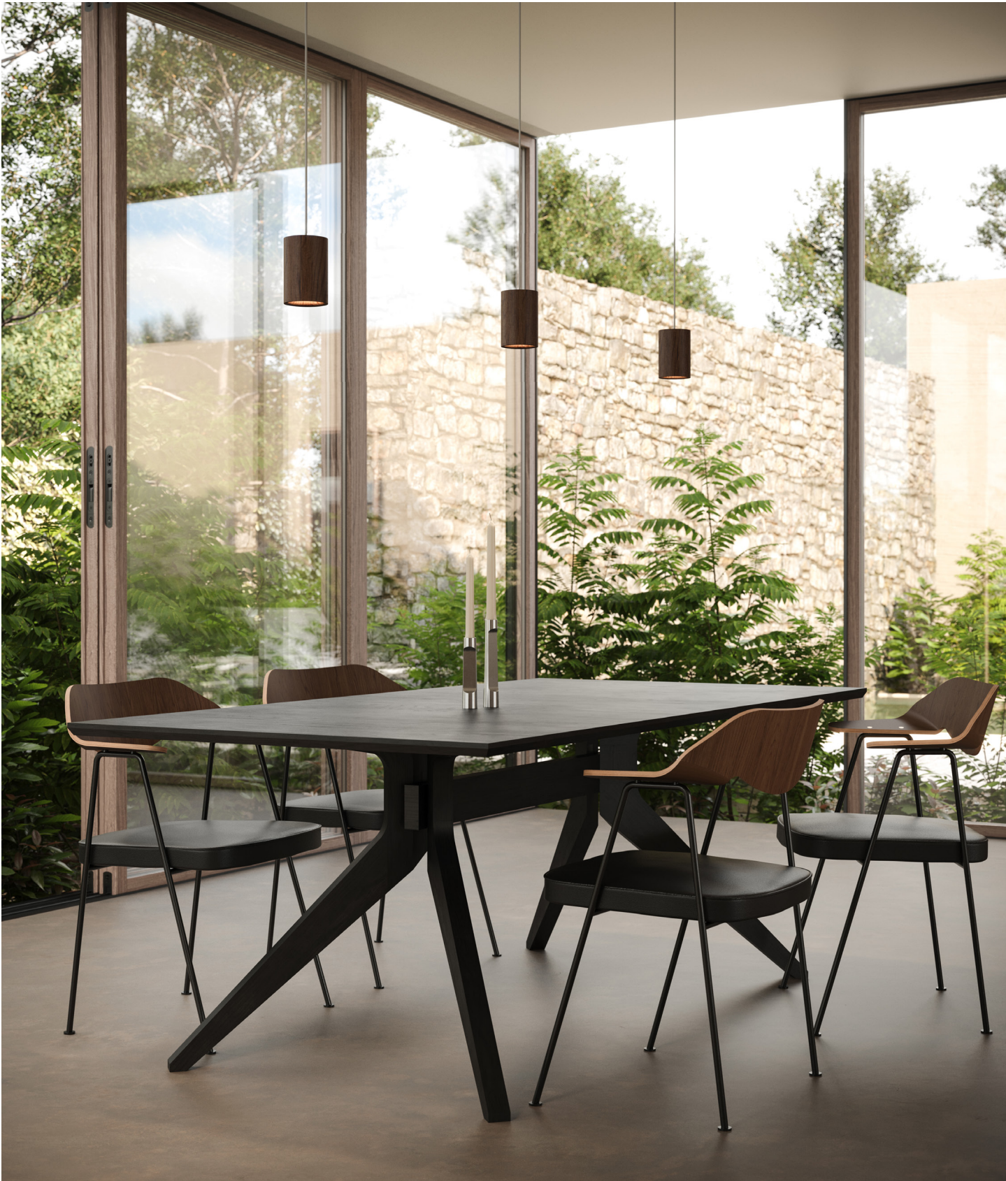
Cross Fixed Table by Matthew Hilton