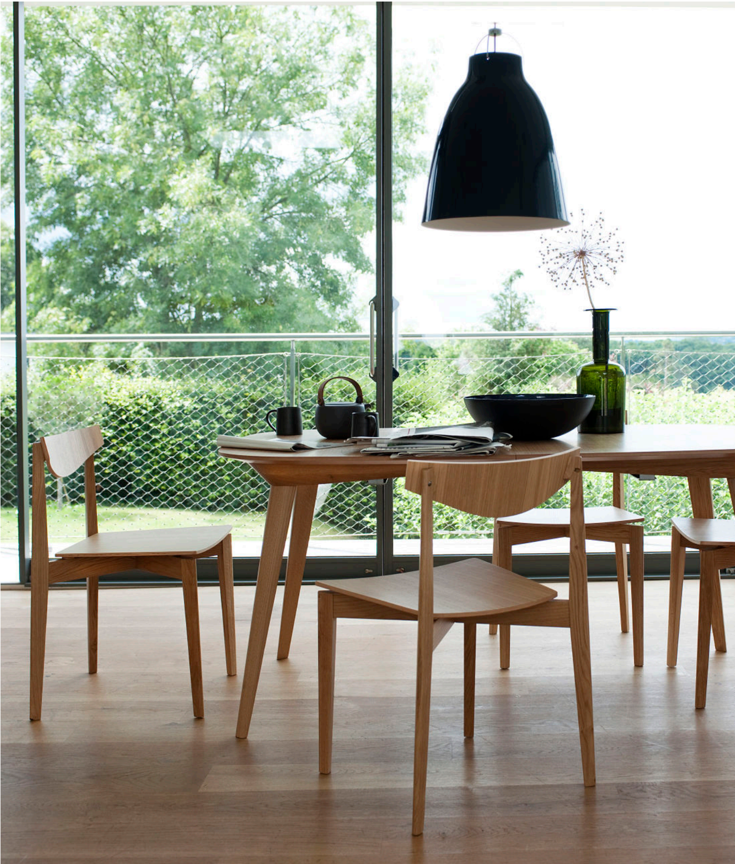
Bridge Extending Table by Matthew Hilton