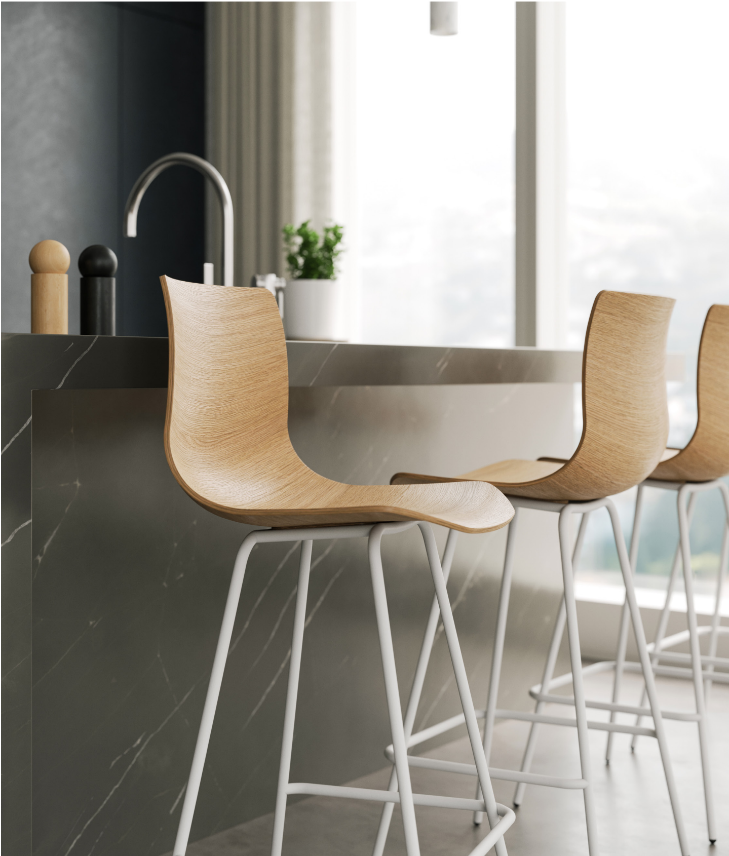
Loku Tubular Stool by Shin Azumi