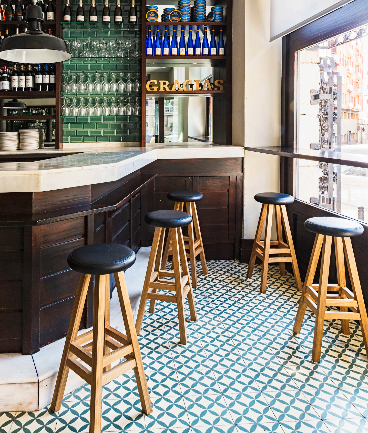
Oki-Nami Stool by Nazanin Kamali