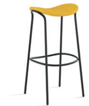
Funda bar stool metal legs