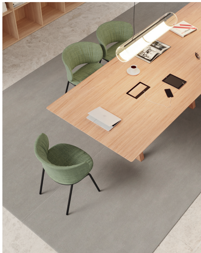
In these pages, pictures of a Trestle in matt oak with Funda chairs, black structure