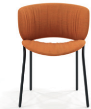
Funda chair 4 metal legs