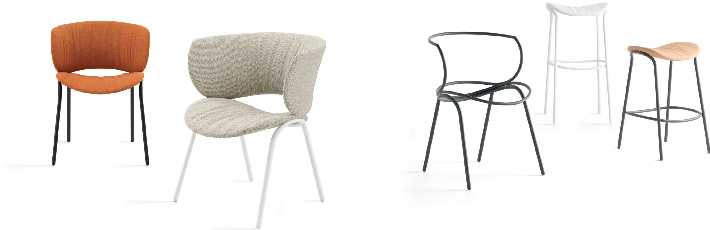
Funda family composed of a chair, a lounge chair and stools with bar and counter height in black and white structures

The commitment to maximum sustainability and comfort shapes Funda, a new range of seats conceived by the outstanding designer Stefan Diez.