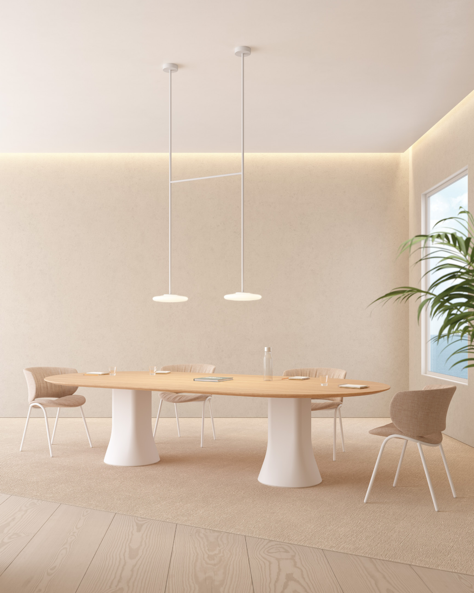
Featuring Funda chair with white structure and Cambio table in white finish

Both of its parts - structure and technical cover - can be recycled independently, extending its lifecycle and fostering circular economy. With Funda we optimize resources, without compromising on comfort, durability or resistance.