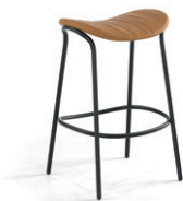
Funda counter stool metal legs