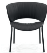
Funda armchair 4 metal legs