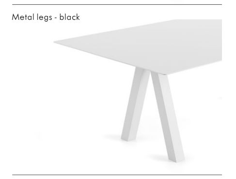
Metal legs - white