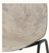
Wood Waste Grey

The Shell of the Eternity Chair is made of Matek®, our patented waste material. Innovative technology allows us to recycle fibre-based waste materials with recycled plastic. Depending on the colourway the waste used for the Matek blend comes from post-consumer e-waste mixed with either wood or coffee waste. The chair itself is a very comfortable chair with industrial and sculptural features and is suitable for both private and public use.