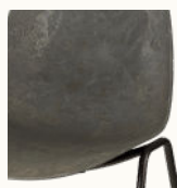
Coffee Waste Dark