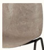
Coffee Waste Light