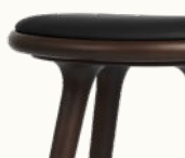
Dark Stained Beech

The High Stool is designed by the Danish architect duo Space Copenhagen and is regarded as a New Danish Classic . With its organic yet minimalist style, this stool is suitable for both residential and commercial use. The High Stool Collection is made from solid FSC® certified. Durable for both private and public use.