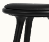
Black Stained Beech