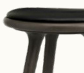
Grey Stained Beech