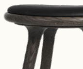
Sirka Grey Stained Oak