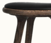
Dark Stained Oak