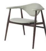
Smoked Oak finish